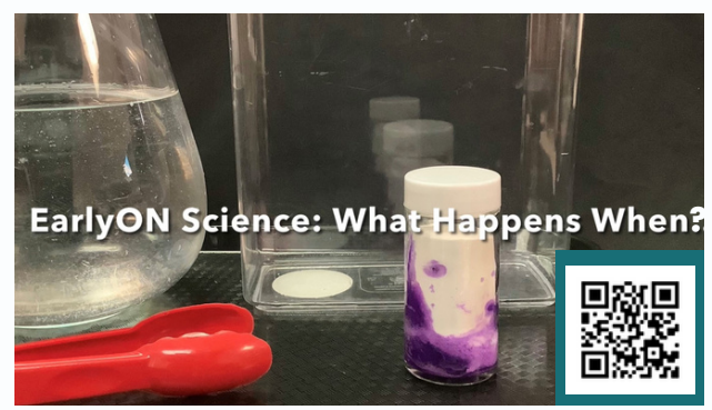
Scan to watch!